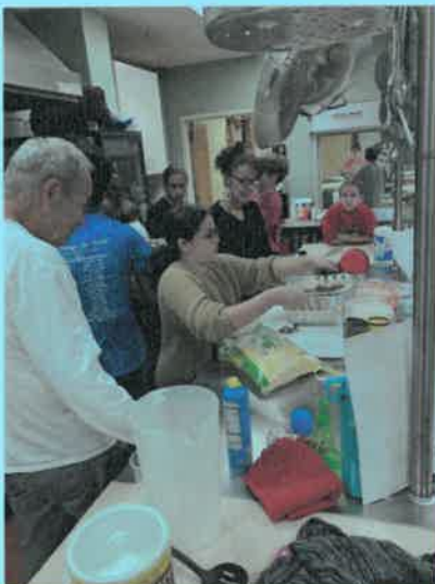
Casseroles being made by our youth and volunteers

Montreat Summer Trips: Montreat High School is for youth who are currently in 8 th -12 th grades and will be June 1-8, 2024. Middle School Montreat is for youth who are currently in 5-8 th grades and will be July 17-21, 2024. Cost is $365. A $150 deposit is due by Dec 1 ($50 of this is to increase the food budget). The remainder ($215) is due Mar. 5. Scholarships are available.