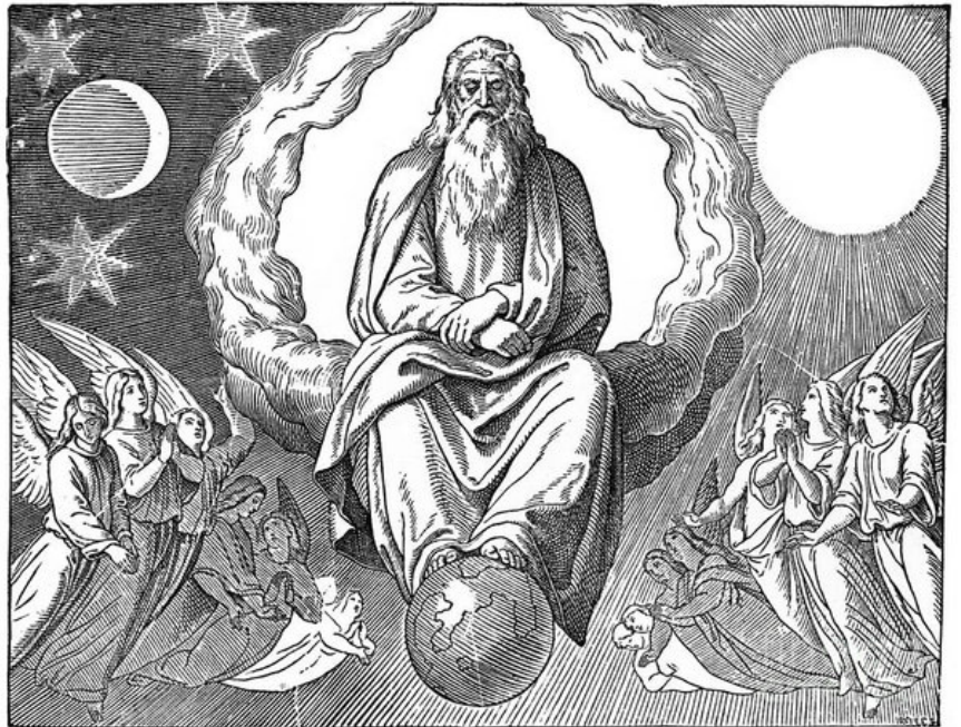
Illustration from Fine Art America- Art print featuring the image: God resting on 7th Day by Granger